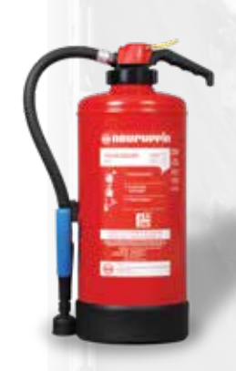
Cartridge-operated extinguisher WA 9 F-500

Comprehensive testing was conducted on an E-scooter 182-cell battery (cell type 18650), a larger battery size than those generally used in devices such as mobile phones, laptops, power tools, gardening tools, model sports (e.g., remote-controlled cars, boats, drones), and E-bicycles (which can use 48-cell batteries). Neuruppin created two different portable 9L extinguisher models lithium-ion batteries up to the tested battery type with 1890 Wh (51.1 V / 37 Ah).