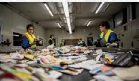
Mixed waste (disposal and recycling)