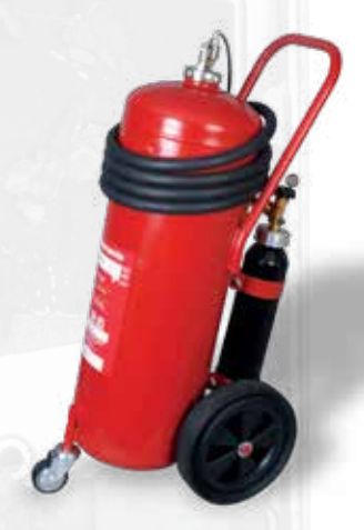
Wheeled extinguisher WA 50 F-500

These models deliver superior fire protection for a range of lithium-ion battery applications, from mobile phones to electric scooters. Additionally, a portable fire extinguisher with 50L content is available for enhanced user safety (greater extinguishing agent quantity, longer discharge time).