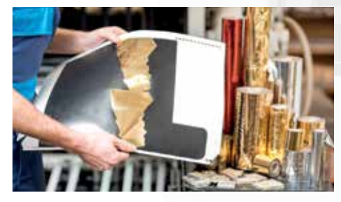
Plastic and foil processing