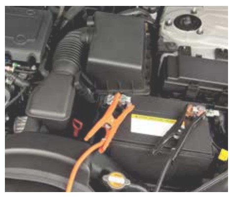
Electric car batteries (magnitude more than 15kWh)