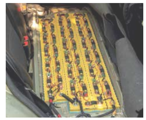
Large and/or unattended battery storage areas